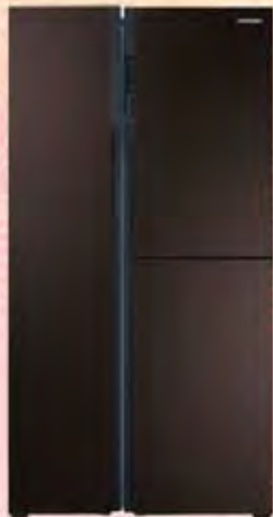
Side by Side Fridge with Twin Cooling Plus™ (RS554NRUA9M) 590L